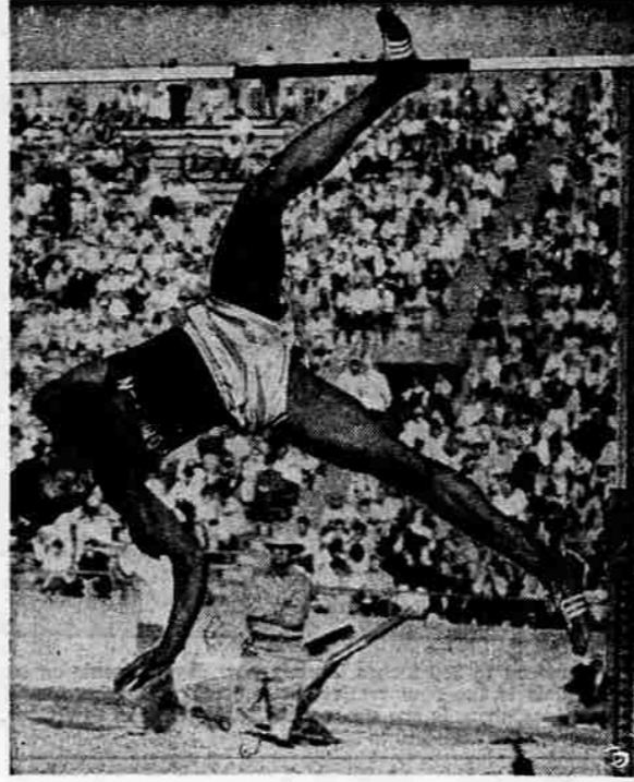
CLEARING BAR at 6 feet 8½ inches, Charlie Dumas, Compton Junior College, demonstrates the form used in breaking world record, while participating in Olympic track preview at Berkeley, Cal.