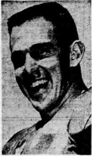
HANDY GUY —Quarterback John Brodie (above) of Stanford University has passed his way to top offensive honors for college football players. Brodie has piled up 748 yards in four games, all but 16 yards on passes. He has completed 61 of 102 attempts and has thrown seven touchdown passes.