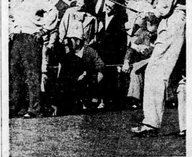
EYES ON THE BALL—The gallery follows flight of the ball as defending champion Dr. Cary Middlecoff of Dallas, Tex., tees off for the 10th hole during the first round of the 53rd Western Open Golf championship at San Francisco's Presidio Golf Club. Watching at left (hands on hips) is Lloyd Mangrum of Apple Valley, Calif. Middlecoff and Mangrum wound up with a first round score of 70.

The Beavers haven't been able to defeat the Cougars in Pullman since 1946, although they scored wins against Washington State in Corvallis in 1949 and 1953.