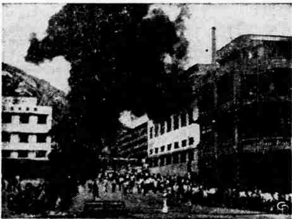
FRENZIED MOBS ARE MILLING in streets as smoke billows from burning auto during rioting between Nationalist and Communist Chinese in Hong Kong. More than 45 were killed, hundreds injured. (International)