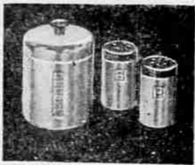
3 — Imported Grease Set Attractive tough aluminum 14" x 5½" grease container with attractively matching 4" salt-and-pepper shakers . . . 88¢