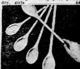
12 — Wooden Spoon Test Set of 5 bleached hardwood spoons from Belgium, 8¼" to 16" in length. Really wonderful for all cooking . . . 88¢