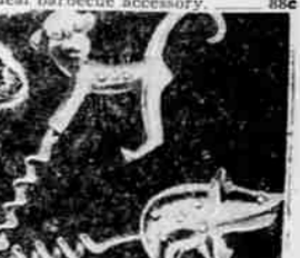
14 — High-Style Zoo Most obliging of household pets—its their pleasure to open your bottles—heavily brass beapangled with brilliant—pig is approx. 4" long, monkey 4½", EACH . . . 88¢