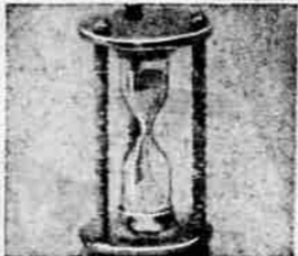
4 — Nice Timing Heavy solid brass egg timer that's jewel-like in its gleaming beauty—hard worker too on that 3 min. long distance call . . . 88¢