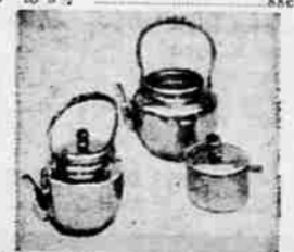
13 — It's a Triple Decker Teapot sugar bowl and creamer fit into one another—carry all three at once—its 4 cup capacity made of durable imported semi-porcelain—floral design . . . 88¢