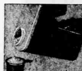
6 — Soap Control Just the amount of soap powder needed for the automatic washer—64 oz. capacity—snap on top for easy filling—Keep your powder dry, girls . . . 88¢