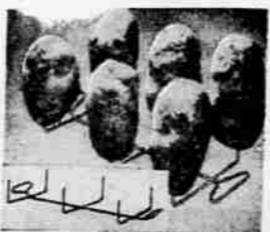
10 — Dover Potato Rack No guess work or hard centers with this potato rack. Holds 6 potatoes. Heats evenly and faster. 2 for . . . 88¢