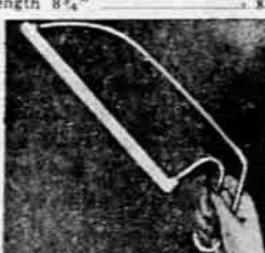
11 — Kitchen Saw All steel frame and Stainless Steel blade. Cuts meat, bone, fowl frozen food, bread. 8¼" length . . . 88¢