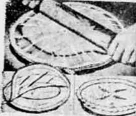
7 — Trusty Crusty Attractive pie crust in perfect circles. Drop in the dough. Zip plastic pie crust maker closed. A few rolls and you have your crust. 9" to 9½" . . . 88¢