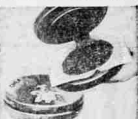
8 — Allwest Burger Press Cherry wood hamburger press. Makes bun size hamburger patties. Hand-decorated "Chef" design. Ideal barbecue accessory . . . 88¢