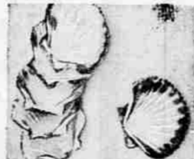
1 — French Baking Shells Bake creamed seafoods, ham, vegetables, etc., in the shell. Set of six 4½" to 5" sea shells. Attractive for entertaining . . . 88¢