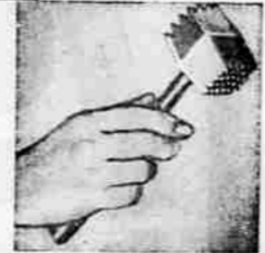
5 — For That Steak Just the thing if the buck you get is tough. Tenderizer of heavy cast aluminum. Will quickly break down the fibers of any meat—Length 8¾" . . . 88¢