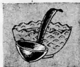
2 — Plastic Ladle A ladle with many uses. Clear unbreakable plastic. Handsome enough for your best punch bowl or for every day use . . . 88¢