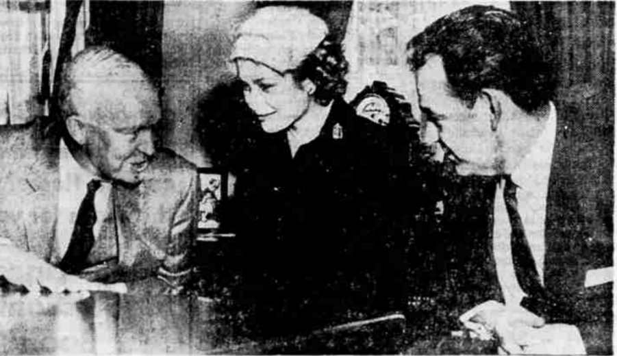
ROYAL VISIT —In his office at the White House, President Eisenhower enjoys a visit with Prince Rainier and his wife, the former Grace Kelly. The Prince and Princess, who are expecting an heir, are in the United States for a vacation.