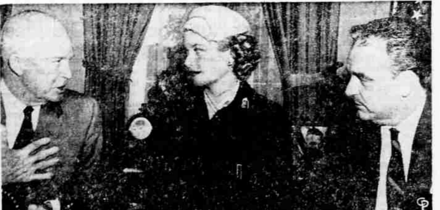
DESCRIPTION OF CHEST COLD which prevents Mrs. Eisenhower from appearing, is given Prince Rainier and Princess Grace, of Monaco, by President Eisenhower when they visit him at White House. Meeting was arranged by State Department.