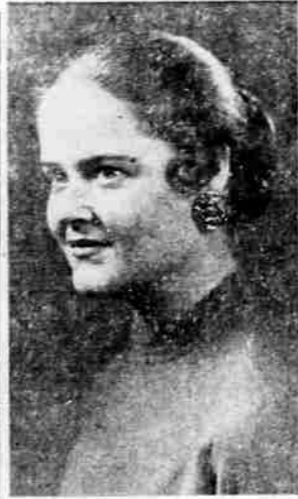
Miss Freeburger

Rogue Valley Navy Mothers will hold an all day meeting Tuesday, October 16, in the courthouse auditorium. Members are asked to take a sack lunch and sewing materials.