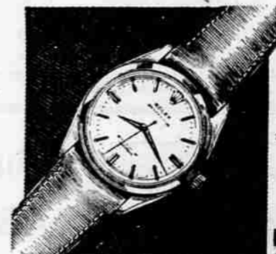
25-jewels in stainless steel $152.50

A Name Synonymous With Supremacy in the Fine Watch Field