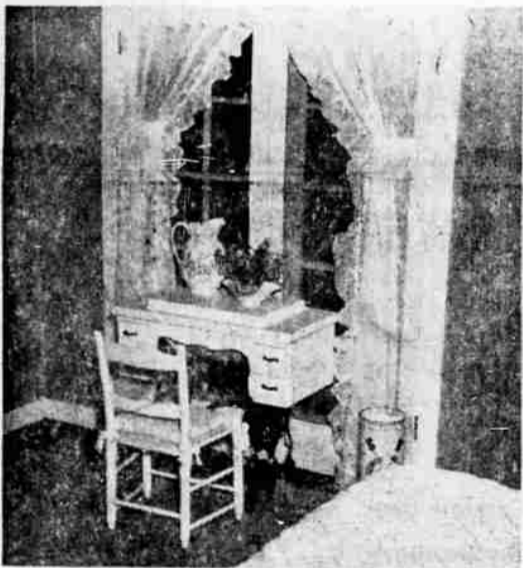
Old sewing machine, painted white, antique pitcher, white ruffled curtains make pretty picture in guest room.