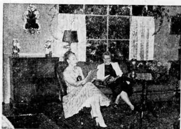
Oriental rugs, dark wood with high luster, colorful ceramic pieces and glassware combine to give the living room an air of both comfort and beauty; room has many windows.