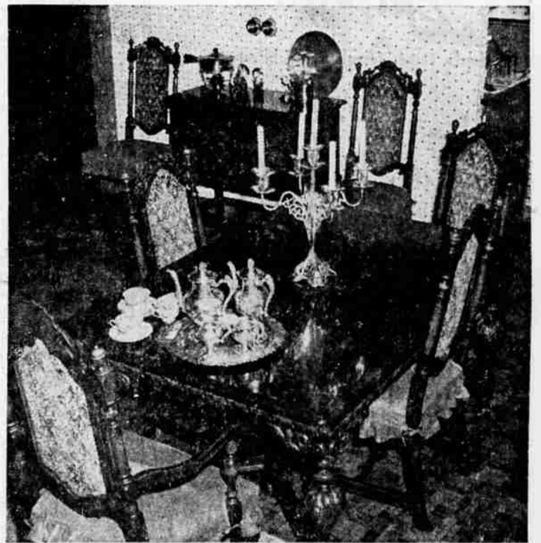
Conventional dining room furniture and papered walls in opposite end of dining room provide contrast to stone floors and brick of fireplace corner. Candelabra is family heirloom brought from Germany.