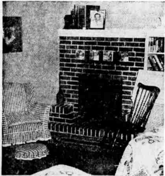
Master bedroom has little corner fireplace and wood box; antique furniture includes butternut wood beds.