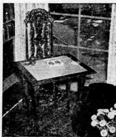
One of two bay windows holds game table, elaborately carved old Charles chair.