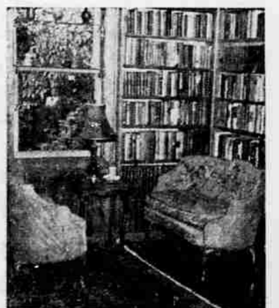
Book corner has twin Belgian needlepoint love seats, ruby glass lamp.