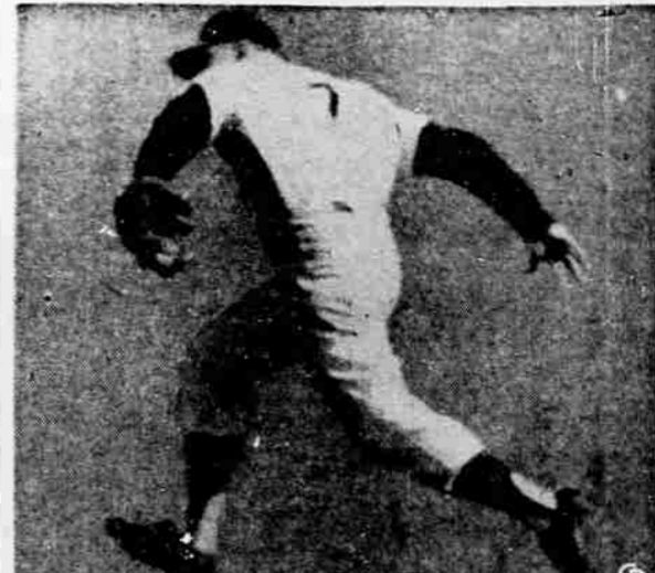
CONTRIBUTING TO SHUTOUT, Mickey Mantle makes sensational catch of Hodges' long drive in fifth inning of fifth World Series game, won by Yankees 2-0. Mantle also collected home run in contest.

It's estimated that consumption of water in the United States has increased 1,300 per cent in the last 50 years.