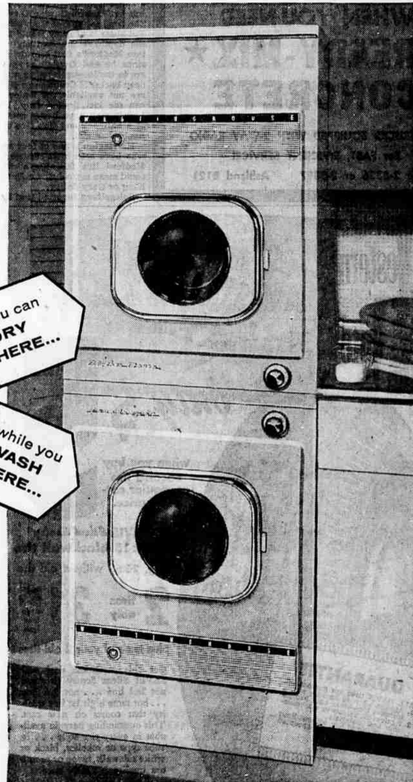
Watch Westinghouse cover the Presidential Campaign on CBS-TV and Radio

SEE THE SPACE-MATES TODAY AT YOUR MEDFORD WESTINGHOUSE DEALERS . . .