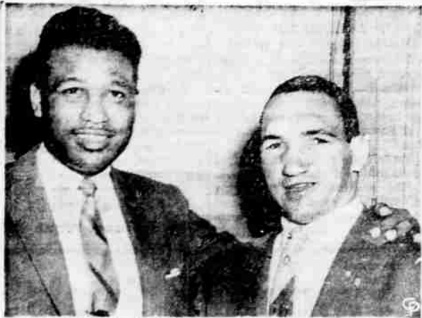
FRIENDLY MEETING is staged by Sugar Ray Robinson (left) and Gene Fullimer after they sign in New York for 12-round bout December 12 in Madison Square Garden with Ray's middleweight title at stake.