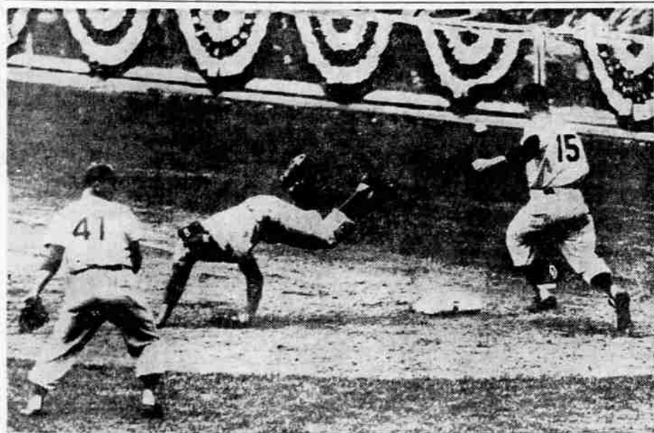
VERY UPSETTING—Brooklyn Dodgers' first baseman Gil Hodges flies through the air while trying for Charlie Neal's wild throw as New York Yankee Joe Collins steams into first base to get on safely on his eighth inning