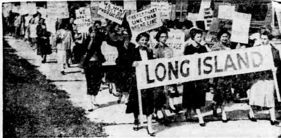
MARCHING IN WASHINGTON, wives of New York, New Jersey and Pennsylvania potato farmers, arrive at Agriculture Department to seek help in reducing surplus which has resulted in slashing of prices. All claim losses in recent sales.