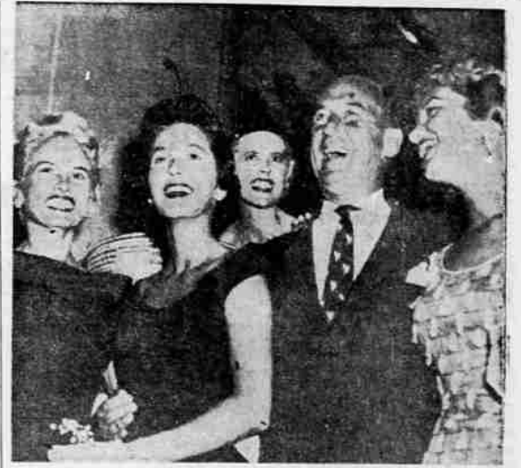
QUICK WITH THE QUIP —Adlai Stevenson proves to be the man of the moment as he is surrounded by the better members of the League of Young Democrats at Oklahoma City. He greeted the group with the remark that if they are the "eggheads" Republicans speak of, he never saw a prettier group of eggheads.

Meat Prices Good through Saturday, Sept. 29th, or until stock has been exhausted.