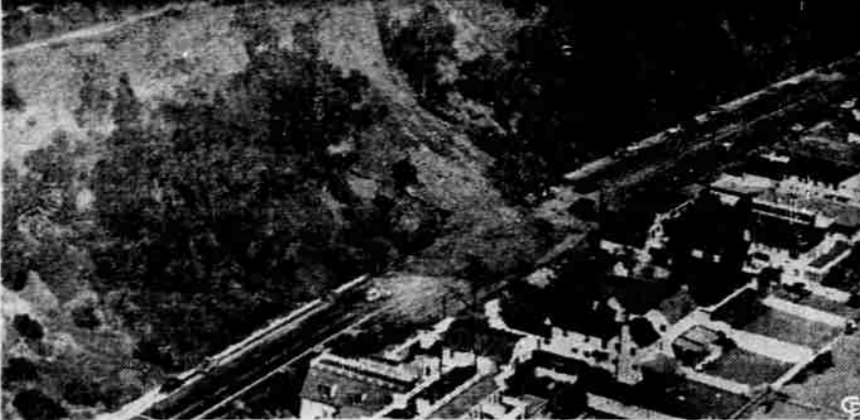
FOUR WOMEN PICKNICKERS , carried 150 feet when a segment of Pacific Palisades, near Santa Monica, broke loose, miraculously emerged with only back injuries and numerous bruises as they rode the slide to the bottom. Tons of earth broke away to bury a section of the Pacific Coast highway and cover automobiles.

Salem — (U.P.) — Non-partisan election of the state labor commissioner has been recommended by the legislative interim committee on elections.