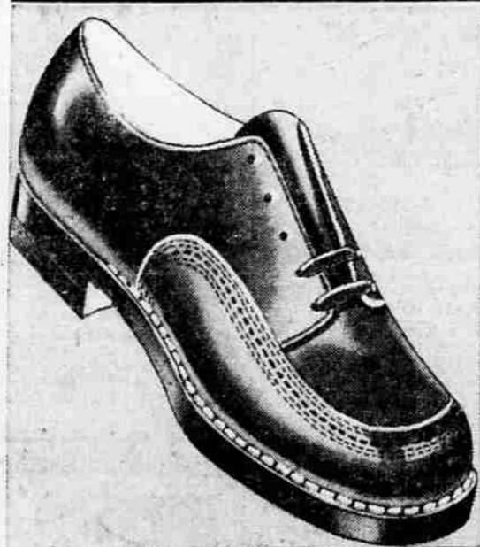
RUGED SCHOOL SHOES WITH GOODYEAR WELT

Sizes 8½ to 12 Beloved styling in fine leather with white rubber soles and heels... Sanitized. B & C widths in sizes 8½ to 12. Sizes 12½ to 3, A, B, & C Widths 6.50