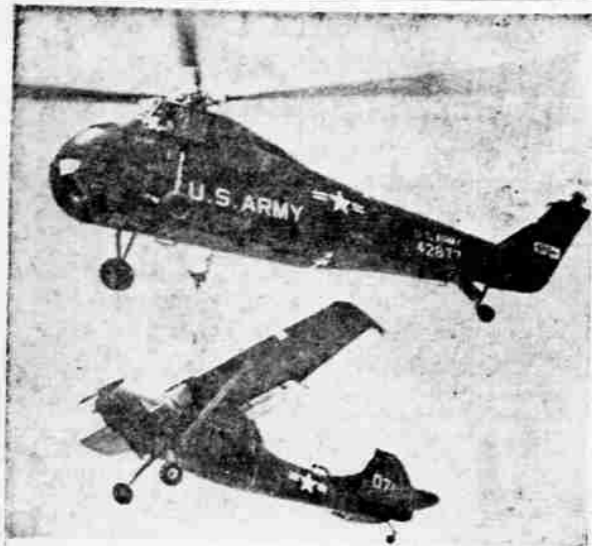
THE ARMY'S WORKHORSE —The Army's powerful new helicopter, the Sikorsky H-34, capable of carrying 3000-pounds or 12 fully equipped soldiers, picks up and carries to safety an L-19 airplane disabled by "enemy" fire during mock battle near San Marcos, Texas. This will be one of the highlights during the National Aircraft Show at Oklahoma City's Will Rogers Field Sept. 1-3.