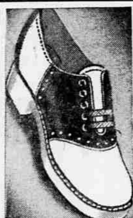
GIRLS' TWO-TONE SADDLE OXFORDS