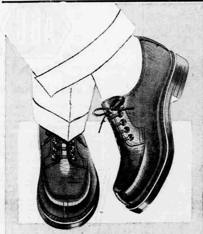
BIG BOYS' AND MEN'S BROGUES

A snap to open Click! It's closed! Opens and closes with a flick of the wrist... Easy to adjust for snug, comfortable fit, too. Fine leathers, rugged stitch-down construction. Sanitized. 8½ to 12. C & D Widths. Sizes 12½ to 3, B, C & D widths 5.90