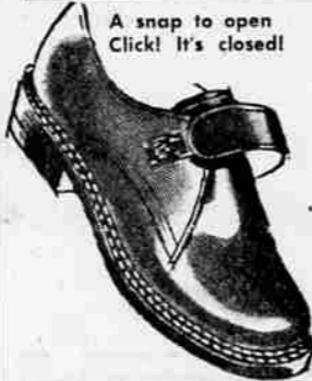
PENNEY'S NEW "SUR-LATCH" OXFORDS With No Laces to Worry About

Sizes 12½ to 3 Sizes 8½ to 12—5.90 Widths A-B-C