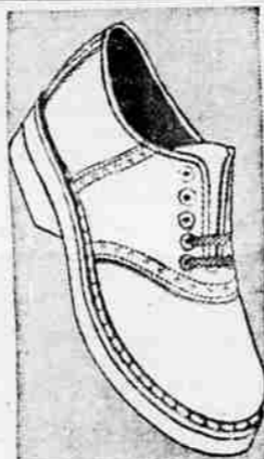
LITTLE GIRLS' ALL-WHITE SADDLES