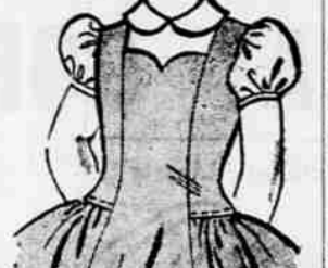
Printed Pattern 9096: Children's sizes 2, 4, 6, 8, 10. Size 6 jumper takes 2 yards 35-inch nap; blouse 1 1/2 yards 35-inch fabric.

Eugene H. Dyrhaug, 22, St. Paul, Minn., was taken by Medford Ambulance service to Sacred Heart hospital Monday evening after his car struck a tree in Douglas county 13 miles north of the Diamond Lake junction on Highway 230. State police said Dyrhaug was traveling north at a high rate of speed, when he apparently fell asleep. Officers said the right wheels of the car moved to the shoulder of the highway and continued on the shoulder for 238 feet. The car suddenly veered to the right, went off the east shoulder of the highway and struck a sugar pine tree about nine feet from the highway. Dyrhaug sustained multiple injuries, including a fractured hand, dislocated hip, chest injuries and lacerations. He is reported in "fairly good" condition at the hospital. He was alone in the car when the accident occurred about 6:55 p.m.