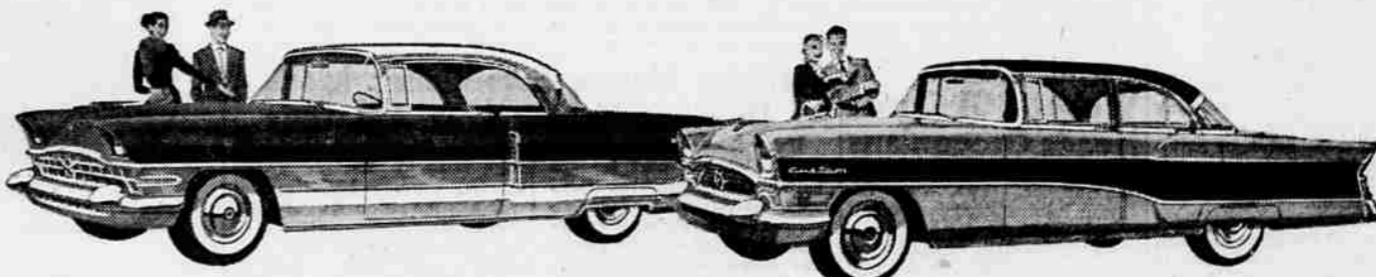
The Inimitable Packard... America's finest fine car—and now you can afford this luxury beyond compare!