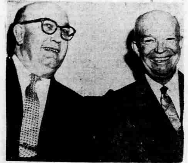
IKE'S FIRST CALLER —As Republican National Convention in San Francisco started its windup, first caller on President Eisenhower, right, at his hotel suite was Republican National Chairman Leonard W. Hall, left. Pair breakfasted together.