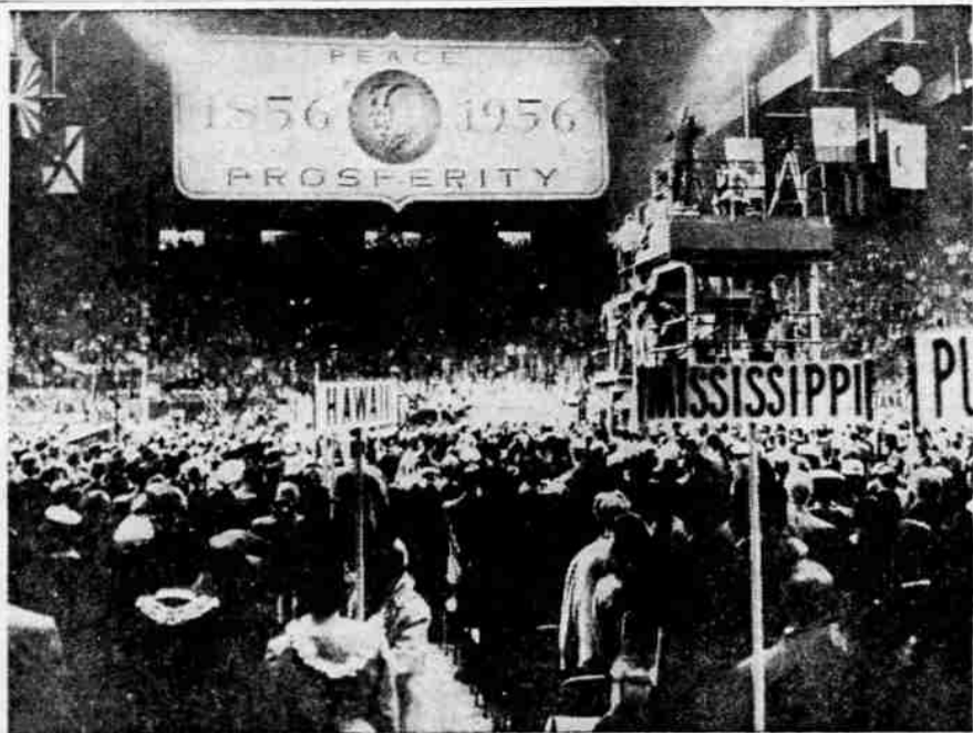
CONVENTION GETS UNDERWAY — The opening session of the Republican National convention is called to order. The jammed appearance as delegates stand as the