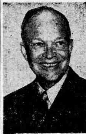
PRESIDENT EISENHOWER 'All-Out Business'