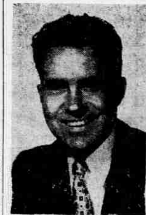
RICHARD NIXON To Speak Before Ike