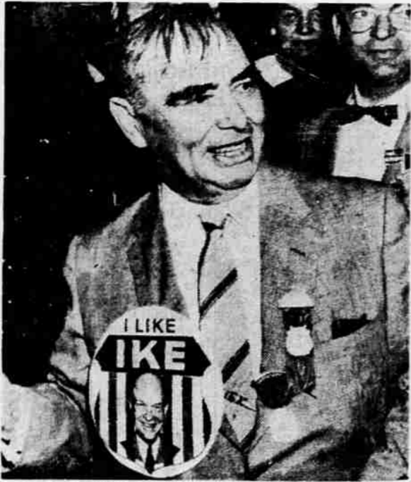
LEAVES NO DOUBT—representative Joseph Martin of Massachusetts, permanent chairman of the 1956 Republican National convention, sports a huge "Ike" button as he arrives in San Francisco's Cow Palace for the opening of the convention.

San Francisco—(U.P.)—Republican platform drafters let President Eisenhower down on one thing. They were unable to heed his request for a brief platform. It ended up at about 13,500 words, twice the length of the 1952 GOP campaign platform.