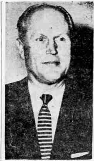
ARTHUR B. LANGLIE Leadership Party Purpose

Growers of corn, cotton, wheat, rice, peanuts and tobacco who agreed to withdraw some of their land from production will receive almost $261 million from the government for cutting down their usual acreage.