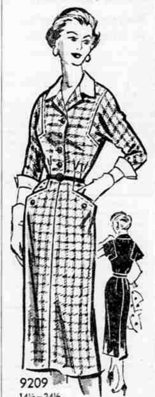
9209 14½-24½ Printed Pattern

Our new PRINTED Pattern for the half-size figure! A lovely, slimming style for fall; button bodice, smart squared armholes and hipline interest. Easy to sew—proportioned to fit perfectly!