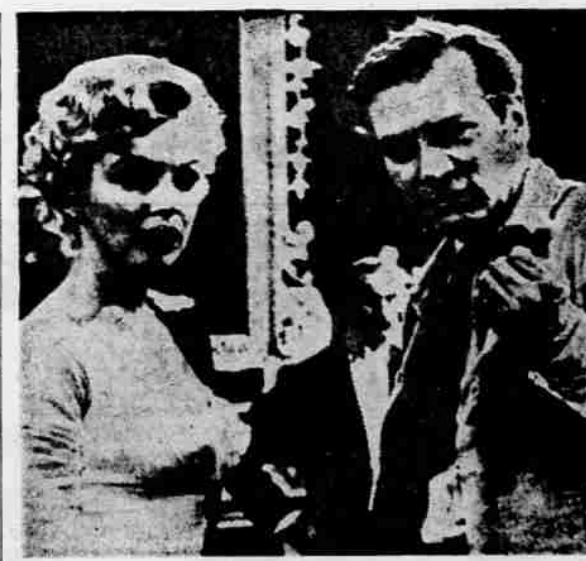
HE'S TELLING HER!—Sir Laurence Olivier has the enviable job of telling Marlyn Monroe what to do. Here he gives businesslike directions to the serious-faced actress on the set of the movie "The Sleeping Prince" in London. Sir Laurence is directing the movie as well as co-starring in it with Marlyn.

Apple muffins are easily achieved and add menu interest. Just add chopped canned apple slices to your next muffin batter for a fine fruity flavor. A bit of cinnamon, maybe.