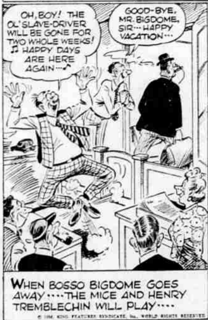
WHEN BOSSO BIGDOME GOES AWAY...THE MICE AND HENRY TREMBLECHIN WILL PLAY...