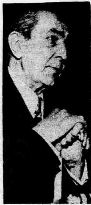
BELA LUGOSI Heart Attack Fatal