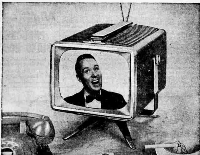
The "Personal." Smallest TV! 8 1/4" high (without stand), 9 1/2" wide, 12 1/2" long. Tilts on stand for easy viewing. Telescoping antenna. 4 colorful, textured finishes. Model 8FT703.

brings you the beauty of TV Original styling, the convenience of "High-Sharp-and-Easy" tuning