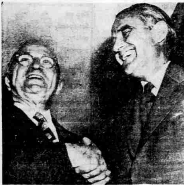
"HE'S A FINE MAN"—Former President Harry Truman exchanges warm greetings with New York Gov. Averell Harriman in Chicago. Mr. Truman told newsmen that Harriman, Democratic presidential hopeful, was "a fine man."