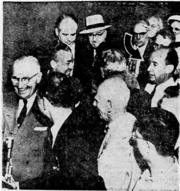
HARRY'S HARD TO KEEP UP WITH —Democratic presidential Adlai E. Stevenson (arrow) has some difficulty reaching former President Harry Truman to greet him on his arrival in Chicago. Harry is well boxed in by newsmen and members of the former Truman administration as he moves along the train station platform. When Adlai finally made it he grasped Harry's hand and threw his arm around his shoulder.

record of 1,132 miles per hour they asked him how the high-speed air friction affected the temperature inside his refrigerated cockpit. His answer might have been the American comment on British speed competition. "Getting hot," he said.