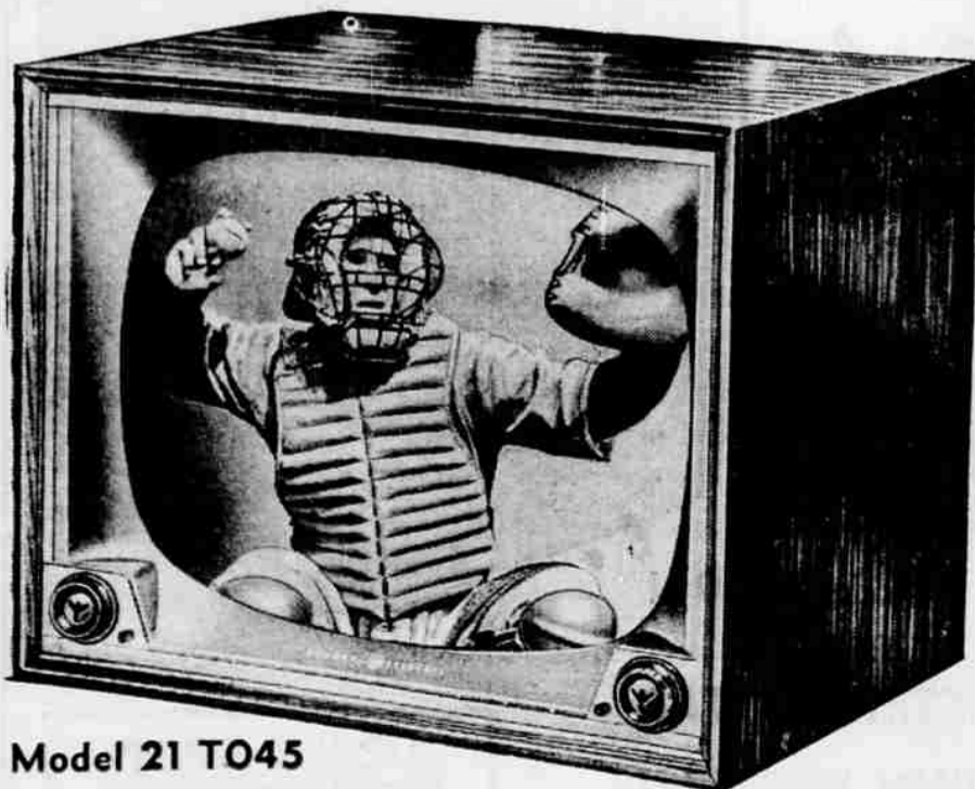
Model 21 TO45

All of the Famed Quality and Dependability of GENERAL ELECTRIC TV . . . at far less than you'd pay for unknown brands! . . . THIS IS A BRAND NEW 1956 "DAYLIGHT-POWER" GENERAL ELECTRIC TV . . . EVERY PART . . . EVERY TUBE . . . IS GUARANTEED FOR ONE YEAR . . . ON A NO QUESTION ASKED BASIS!