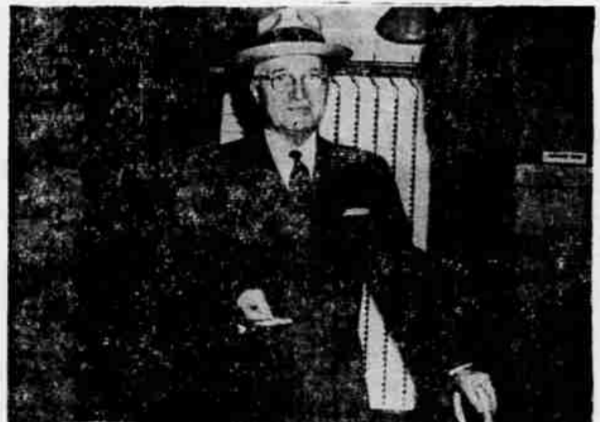
YEPI IT'S HARRY — You guessed it, the feet and cane in the voting booth picture belong to former President Harry S. Truman, shown emerging from the Independence, Mo. voting booth (above). Harry's next move will be to Chicago where he will play big part in choosing the Democratic presidential nominee.

Democratic Convention Headquarters, Chicago — New York's Gov. Averell Harriman on his fight "to the finish" for the Democratic presidential nomination: "I am in this to the last ballot, win or lose. I am fighting for the principles I deeply believe in. I believe I will win."