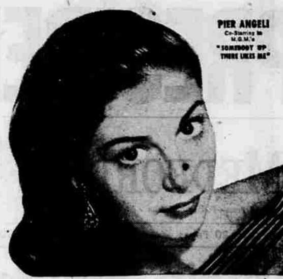
PIER ANGELI Co-Starring in "SOMEBODY UP THERE LIKES ME"