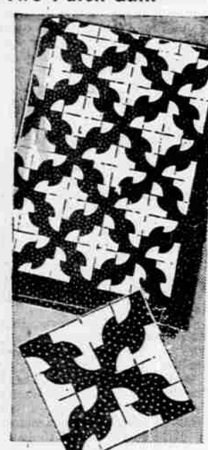
7048 by Alice Brooks

Wonder of the World — just two patches, two materials. This unusual design, dating back to pioneer days—a lovely heirloom. Pattern 7048: Two-patch quilt! Pattern, charts, directions included; material requirements for single and double-bed sizes. Send TWENTY-FIVE cents in coins for this pattern — add 5 cents for each pattern for 1st-class mailing. Send to Medford Mail Tribune, Household Arts Dept., P. O. Box 168, Old Chelsea Station, New York 11, N. Y. Print plainly NAME, ADDRESS and PATTERN NUMBER. Two FREE patterns—printed in the new Alice Brooks Needlecraft book for 1956! Stunning designs for yourself, for your home—just for you, our readers! Dozens of other designs to order—all easy, fascinating hand-work! Send 25 cents for your copy of this wonderful book right away! USE TRIBUNE WANT ADS