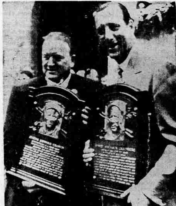
ENTER HALL OF FAME—Joe Cronin (left), General Manager of the Boston Red Sox, and Hank Greenburg, general manager of the Cleveland Indians, display plaques following their installation into baseball's Hall of Fame at Cooperstown, N. Y.

Chicago—(U.P.)—American families have invested more than $100,000,000,000 in new housing since the end of World War II, according to the United States Savings and Loan League. The sum represents the purchase of more than 10,000,000 new houses built in the last 10 years.