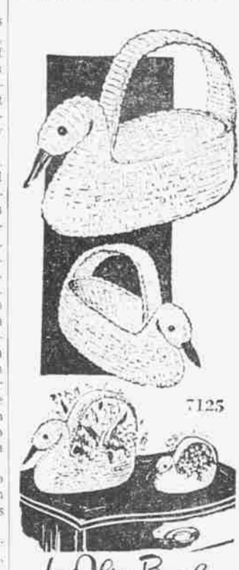
7125 by Alice Brooks

Easy crochet adds a decorative touch to your home. For the large and small duck baskets you follow the same directions. Pattern 7125: Directions for crocheted duck baskets. They are made entirely in single crochet, using straw yarn or cotton.