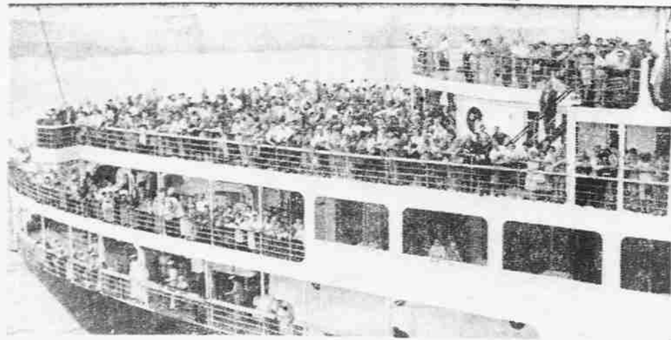
HAPPY TO BE ALIVE, 760 survivors of Andrea Doria arrive in New York aboard French liner Ile de France after dramatic rescue off Nantucket, Mass.

The first actress to use the first name Kim was Kim Hunter. Second Kim Stanley. Third Kim Novak. None of these Kims were given that name by their parents. Kim Hunter's real name is Janet Cole. Film producer Dave Selznick named her Kim Hunter. Kim Stanley's real name is Patricia Reed. And Kim Novak was originally Marilyn Novak.