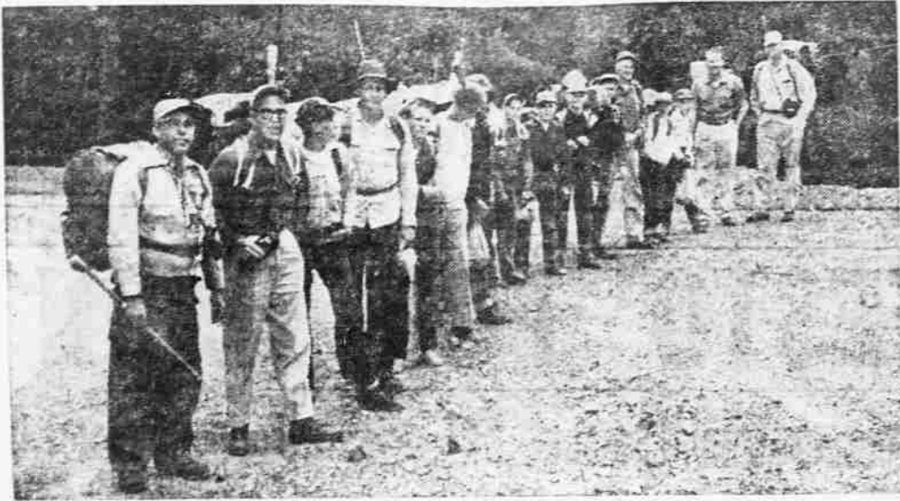
ROGUE HIKERS —Leaders and members of Boy Scout Troop 13 stand with their loaded pack sacks just before they started out on an 80 mile walking-boating hike along Rogue river. The men and boys traveled from one

mile below the Graves creek bridge in Josephine county to Agness where they caught a river boat to Gold Beach. The adventure took a week, from June 23 to 30.