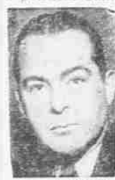
Harold E. Stassen