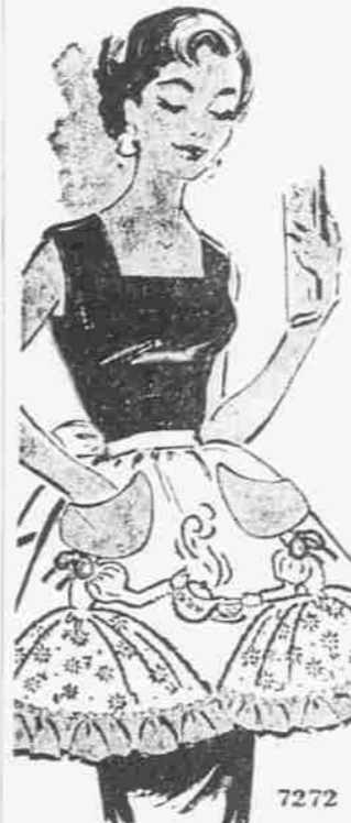
7272 by Alice Brooks

home — just for you, our readers! Dozens of other designs to order — all easy, fascinating hand-work! Send 25 cents for your copy of this wonderful book right away! EASY PINEAPPLE CAKE New York—(UP)—The new instant butterscotch cake mix provides a delicious base for pineapple upside down cake. Make the pineapple topping in your own favorite way and prepare the cake mix according to package directions. Bake in one large pan, or two small ones. High waists are marked by