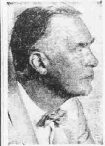
"SURPRISE" is expressed by Massachusetts Gov. Christian A. Herter (above) over suggestion Vice President Nixon withdraw in favor of Herter.