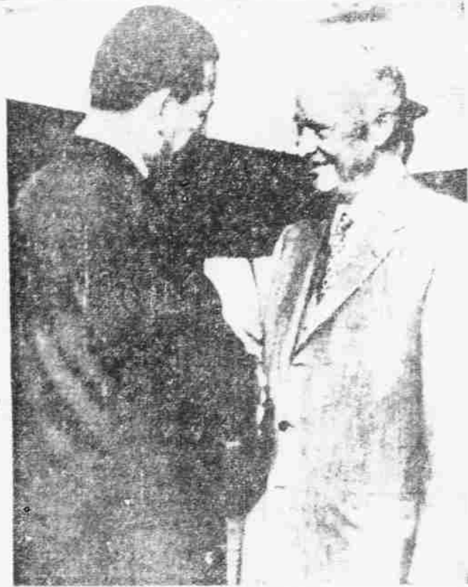
PANAMA PARLEY —President Eisenhower (right) is greeted by President Arias of Panama as he arrives in Panama City for an historic conference with 18 other American chiefs of state. It was Ike's most arduous physical undertaking since his operation.