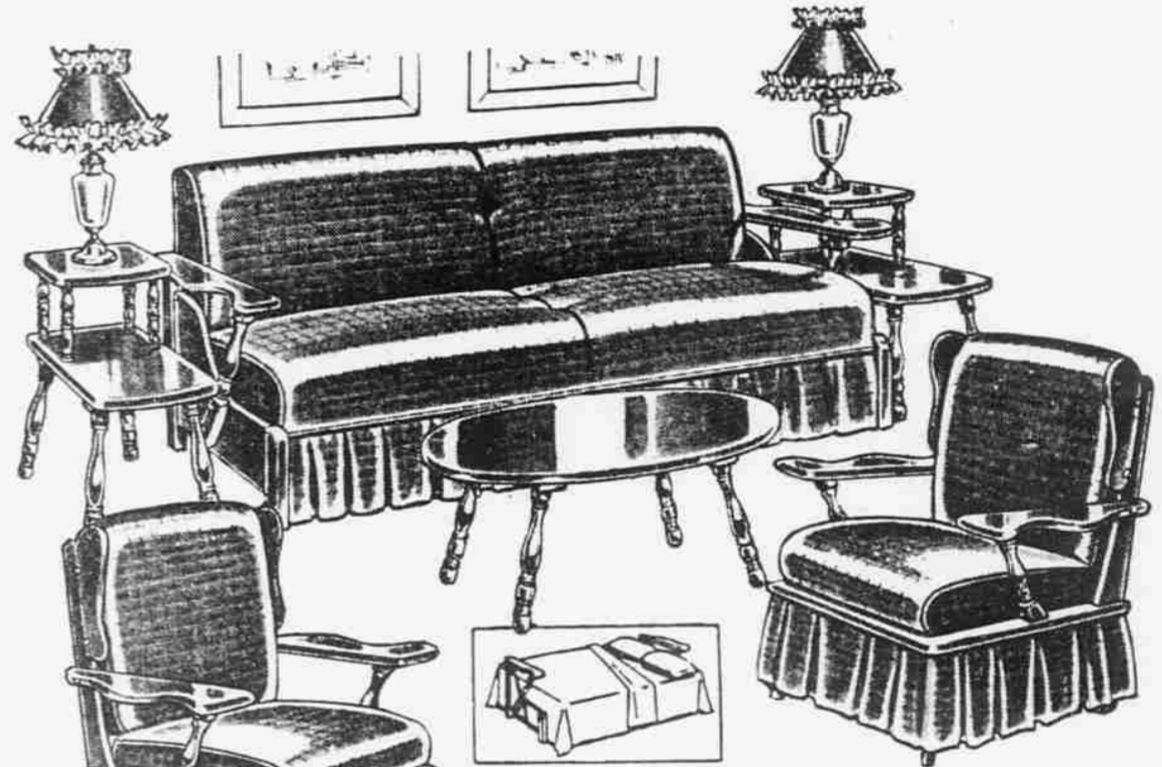
Sofa opens to guest bed

7-pc. Sofa Bed Group — Save $100 A WHOLE ROOM FULL OF NEW ENGLAND MAPLE