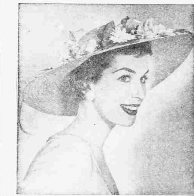
CARTWHEEL—The classic summer cartwheel in natural leghorn is wreathed in colorful field flowers for one of the summer's prettiest hats, and a hat that every woman can wear becomingly. It is a Walter K. Marks creation.