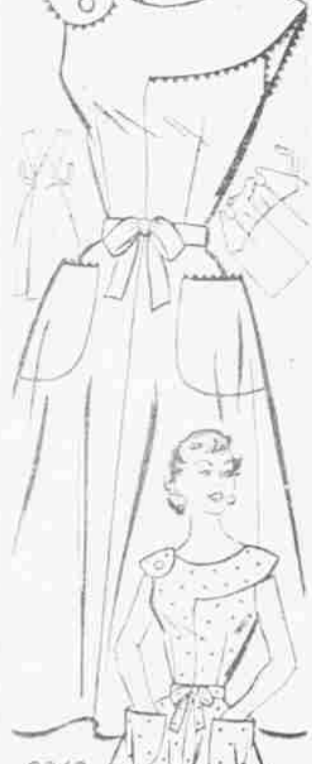
9362 by Marian Martin

Snip to sew, smart to wear— a cool sundress, or shortie collar apron. It's your favorite wrap-around style, that fits every figure to smooth perfection.