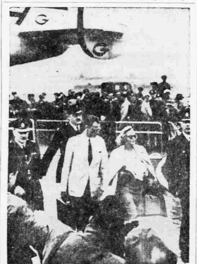
I SAY, QUITE A TURN OUT —Some 200 English fans brave the rain to greet Marilyn Monroe and her play-wright husband, Arthur Miller, as the couple step from their TWA plane at London Airport to begin their honeymoon. Newsmen mobbed the movie queen who told them it was, as she put it, "wonderful" to be in England. Marilyn will film a movie while Arthur works on a new version of one of his plays. Later they plan to tour France and Italy.