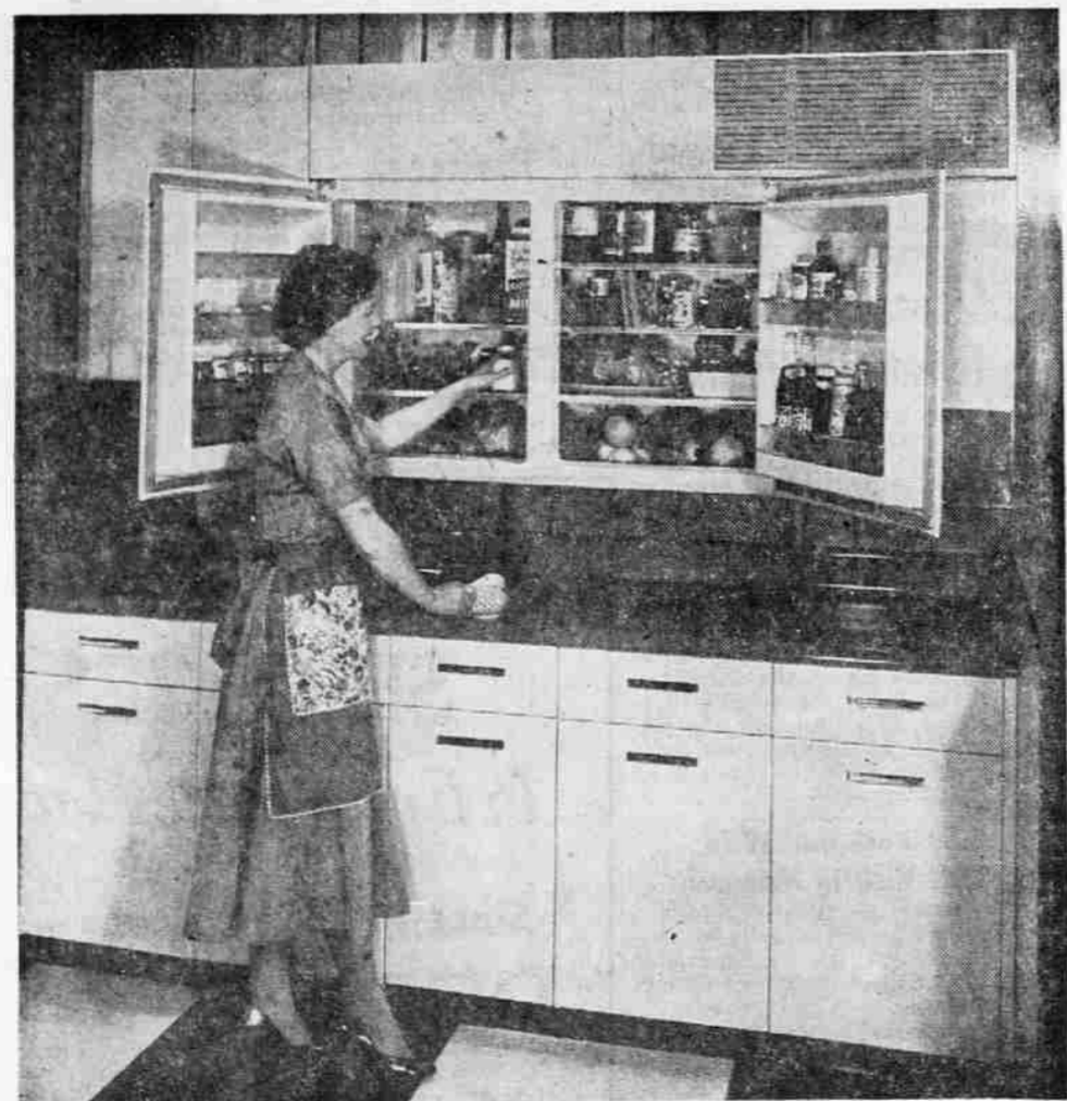
G-E's MAGNIFICENT WALL REFRIGERATOR

Here's a real value . . . budget priced! Brand new 1956 General Electric refrigerator-freezer combination with automatic defrosting refrigerator section and a big 70-pound true zero-degree freezer. Wonderful convenience with revolving shelves and Magnetic Door that has foot pedal opening, self closing, quiet closing and a more efficient seal. Deluxe features, GE quality and dependability . . . come in today for the best refrigerator buy in town!