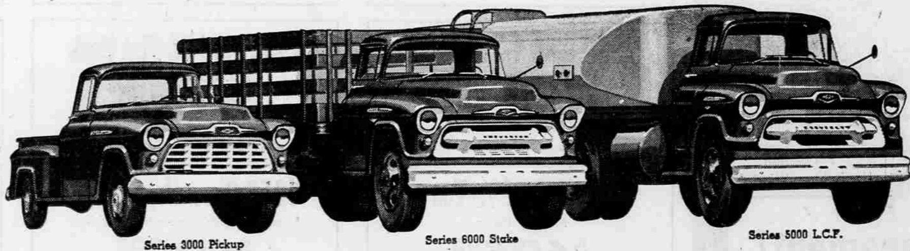
Series 3000 Pickup

*Optional at extra cost in Series 5000 through 10000 truck models.