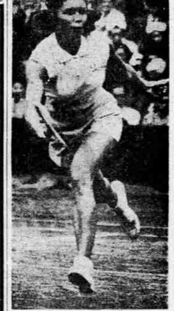
EYE ON THE BALL —Mrs. B. Fleit, the former Beverly Baker, charges in to return ball to Mrs. Z. Kormoczi of Hungary during singles match at Wimbledon, England. Favored to win the women's singles, Beverly was scratched from tournament because she is expecting a baby.

Waivers Signed By Bilko, Mauch Los Angeles—(U.P.)—Home run slugger Steve Bilko and his teammate, Gene Mauch, of the Los Angeles Angels have signed 1957 contracts with the Pacific Coast league club. The Angels announced Thursday that both players also signed waivers to prevent them from being grabbed up by major league clubs at the end of the season. First Sacker Bilko has basted 38 home runs so far and maintains a .384 batting average while second baseman Mauch has an impressive .360 average at the plate.