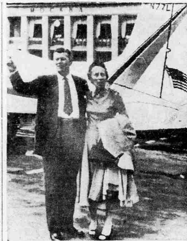
PARTED THE IRON CURTAIN —William Lear of Santa Monica, Calif., and his wife stand beside their twin-engine, American flag decorated plane, after arriving in Moscow, Russia, from Berlin, Germany. Lear, 54, inventor of automatic pilot, received permission from the Communists to make the first private plane flight from Berlin to the Russian capital since World War II.

(Copyright 1956, General Features Corp.) Use Tribune Want Ads Just Call 2-6141