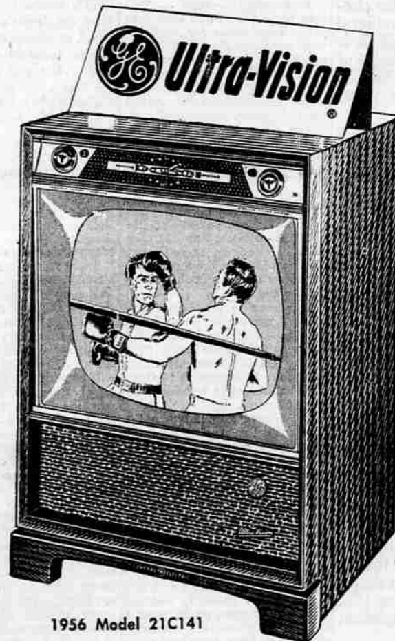
1956 Model 21C141

SAVE! Buy Now! G-E Ultra-Vision TV SALE!