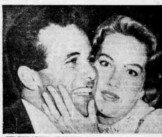
CELEBRATING AT NIGHT CLUB in Hollywood, Actress Leigh Snowden and Accordionist Dick Contino announce engagement. She is wearing three-carat diamond ring. They plan to wed in fall.

TOO LATE TO CLASSIFY NOTICE—COMMERCIAL SPRAYING ALL KINDS Ph. 2-5378. WITHOUT BUNDLES OF OLD NEWSPAPERS for sale 20c each Mail Tribune Office 27 North Fir ENROLL NOW for Sewing Class at Singer's Sewing Center, 318 E. Main. Ages 10-17. Dead line Sunday Classified is at noon Saturday; 10 a.m. Monday for Monday; other days 9:30 previous day.