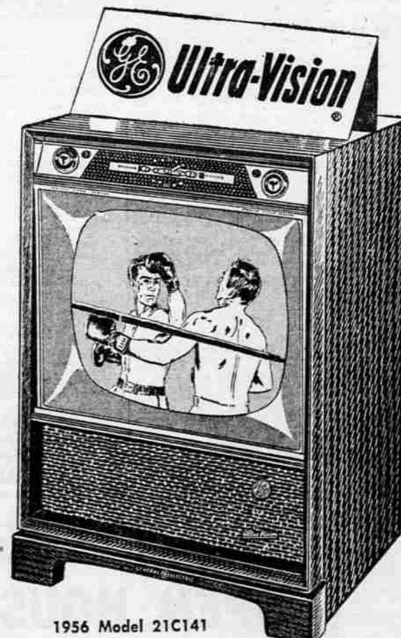
1956 Model 21C141